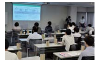
Class at an on-site safety and health education

In accordance with Article 60 of the Industrial Safety and Health Act, we conduct safety and health education for those who are newly charged as foremen (first line supervisors) or others to directly guide or supervise workers in operations, by inviting a lecturer from the Japan Industrial Safety & Health Association. The Daigas Group holds training sessions five times a year for newly appointed managers who need foreman education. Approximately 160 people take the training.