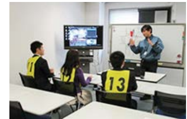
Class at an on-site driver training center

The Safe Driving Training Center run by Osaka Gas offers safe driving education with a focus on practical training, and we are seeking to extend safe driving practices throughout the Daigas Group to improve safety across the Group as a whole. In FY2024.3, a total of 3,643 employees from 42 companies, including Osaka Gas, took part in this safe driving program. The intranet and email are used to share and disseminate information across the Group as a whole to reduce accidents.