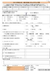
Interview with employees in their second year of work regarding stress