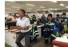
Scene of squat exercises, part of a health-enhancement physical training program being conducted before the start of the day

We have also created a poster encouraging employees to keep both hands open while walking and sent it to each and every organization.