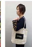
Introduction of laptop tote bags