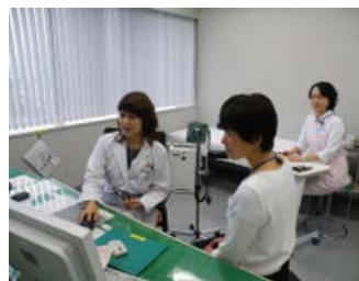
Health checkup at the Daigas Group Health Development Center

In FY2024.3, 13,767 employees of 34 companies (the total number from Osaka Gas and its affiliates) received health checkups at the Center.