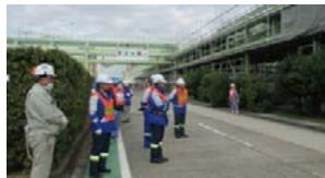
Safety patrol with partner companies

At piping works, we work with partner companies in organizing exercise sessions to enhance physical performance and prevent accidents involving older workers falling from, or tipping over, stepladders.