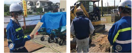
Fan-equipped work clothes

Osaka Gas has introduced work clothes with built-in fans as part of measures to improve the working environment and prevent heat stroke in the summer with extreme heat (except for workers handling raw gas because fans are not explosion proof). In FY2019.3 we started considering the introduction of fan-equipped work clothes and conducted research using monitors to assess the required quantity and needs. The fan-equipped work clothes are made using a fabric suitable for fitting fans while following the design of the current ones. Also, the fan-equipped work clothes allow the use of a full harness safety belt, which has been mandatory from January 2022 due to a revision of the Industrial Safety and Health Act.