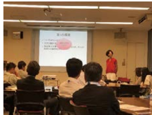
Mental health training for managers and supervisors