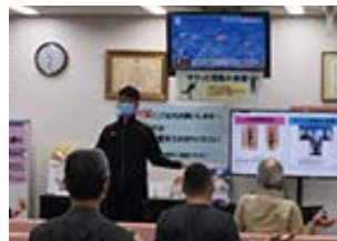
Easy and quick exercise