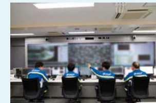
Central Control Room

We have a gas supply monitoring and control system that keeps a constant watch on gas, from the LNG terminals to every corner of the pipeline network. The system constantly gathers data on gas pressure, flow volume, and irregularities from points around the gas pipeline network, providing integrated control through remote operation that controls production and supply and detects any problems.