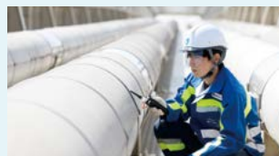
Regular inspection of gas pipes on bridges