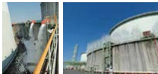
High-expansion foam discharge and water curtain facilities along the dike around an LNG tank

Tanks are equipped with advanced earthquake-proof technology. Should there be a gas leak, the tanks have dikes to stop the LNG from flowing to the outside. And there are high-expansion foam discharge systems and water curtain facilities to contain any spilt LNG.