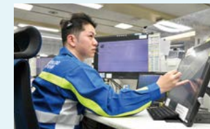
Central Control Room (emergency call reception)

The Central Control Room accepts emergency reports, such as a gas leakage, around the clock via dedicated telephone lines set up in the Room. After an accident is reported, emergency staff will be sent to the site immediately and work in close collaboration with local police and fire departments.