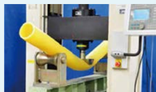
Pipes made of polyethylene exhibit superior strength

City gas is delivered to customers via the gas pipeline network. Therefore, Osaka Gas Network Co., Ltd. recognizes that keeping the gas pipes safe and properly maintained is one of the most important matters and is constantly replacing old metal pipes with pipes made of polyethylene, which is highly durable and earthquake resistant.