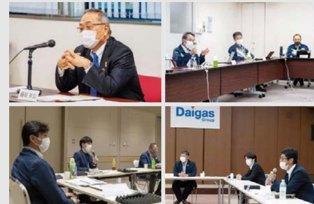
The President's visit to a workplace

In FY2023.3, a total of eight workshops were held for the Energy Technology Laboratories, Osaka Gas Urban Development Co., Ltd., Osaka Gas Australia Pty. Ltd. and other organizations. Also, roundtable discussions with young employees were held three times.