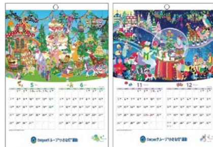
A charity calendar for raising donations from Daigas Group employees, alumni, other relevant parties and customers

The Small Light Campaign gathers funds through various activities, including charity calendar donations and proceeds from the Midosuji Fureai bazaar, a used book bazaar, as well as donations from workplace groups, individuals, and the Suzurankai (Osaka Gas alumni) — all managed as the Small Light Fund. The money is used to support the activities of the Small Light Campaign, to support recovery in disaster-hit areas, and to donate items for social welfare or educational purposes, such as wheelchairs and picture books, to all municipalities served by Osaka Gas.