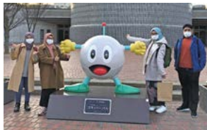
Graduate students of University of Indonesia visiting the Gas Science Museum during their Japanese language training program

Marking its 30th anniversary, the Foundation reviewed its aid activities to date, in which it has provided subsidies totaling approximately 590.11 million yen, scholarships to 10,494 people, and grants for 438 research themes. In addition, it held an interview with the Chairman and an online meeting with local students to further explore future directions of its activities.