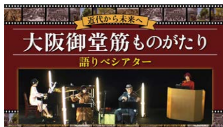
Produced "Osaka Midotsuji Monogatari" and released it on Youtube.

Local communities face many social issues, and these issues are becoming more advanced and complex. The Daigas Group regards the practitioners of "My Project = Starting to Solve Social Issues by Considering Them as if They Were My Own" as future partners in livening up communities in the Kansai region. The Group disseminates their activities to society and aims to collaborate with various stakeholders.