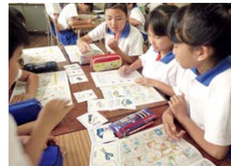
"Lessons in Disaster Response," in which children learn in a workshop format how their lives can change during a disaster and useful knowledge for disaster preparedness