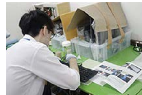
PC recycling work at a welfare workshop

The "Hajimaru-kun Personal Computer Donation Program," being organized by Group member OGIS-RI, based on the idea of helping the environment by encouraging the reuse of PCs, is also a social contribution activity that provides employment support for the disabled to whom recycling operations are outsourced, as well as IT support for donation recipients. Since this program started in 2009, it has donated over 4,533 PCs to social welfare organizations. FY2023.3, the 13th Daigas Group Hajimaru-kun Personal Computer Donation Program donated 190 "Hajimaru-kun PCs" to 150 welfare facilities in six prefectures in the Kansai region, Japan.