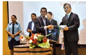
Presentation ceremony at National University of East Timor