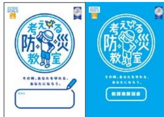
Left: Learning material for upper grades of elementary school (A4, 40 pages, full color) Right: Teacher handbook (with worksheets and supplementary teaching materials for the class, A4, 40 pages, full color)

In response to the increased need for disaster response education following the Tohoku earthquake and tsunami of 2011, we created an original textbook for an upper elementary school on the theme of disaster response Lessons in Disaster Response that we distribute to local elementary schools. The textbook teaches children about natural disasters in Japan. While studying it, children take a workshop designed to impart useful knowledge about the changes that take place in people's lives when a disaster strikes. The textbook also contains a checklist of items to prepare and things to do at home to prepare for emergencies. Over a period of nine years, the textbook has been used widely at junior high schools, high schools, and universities, as well as by local governments and local residents' associations. Over 240,000 textbooks in total have been distributed.