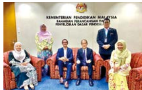
Meeting at the Ministry of Education Malaysia