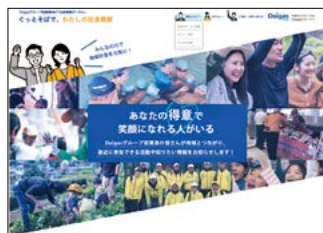
The “Social Contribution Portal Website,” an in-house bulletin board that provides employees with information on volunteer activities, etc.

In FY2023.3, we launched the “Social Contribution Portal Website” to encourage participation in community contribution activities.