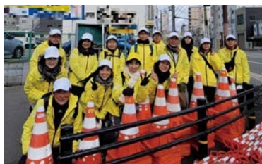
To support the Osaka Marathon 2023, 83 employees participated in the event as volunteers.