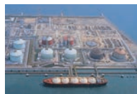
Himeji LNG Terminal at start of operations (Hyogo Prefecture)